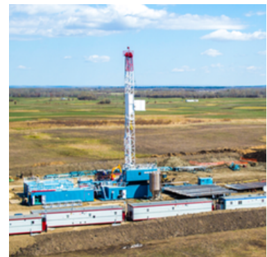
Advisory firm says