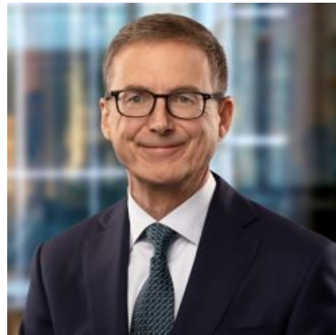
Bank of Canada