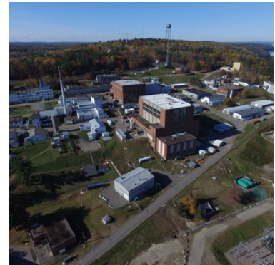
Feds launch nuclear