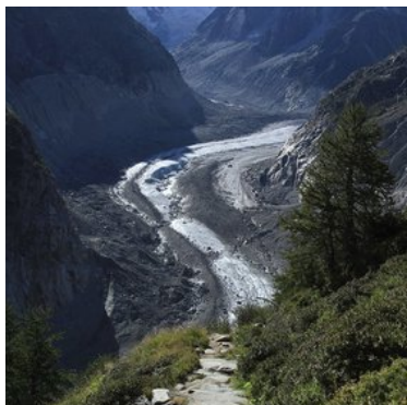
Go see the biggest