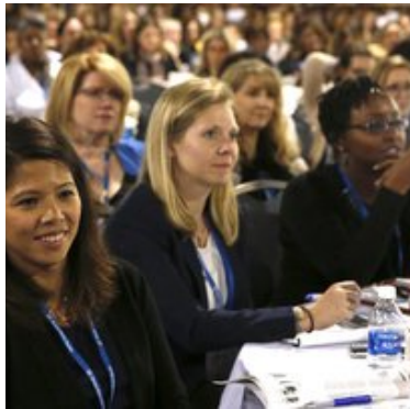
Calgary Women in